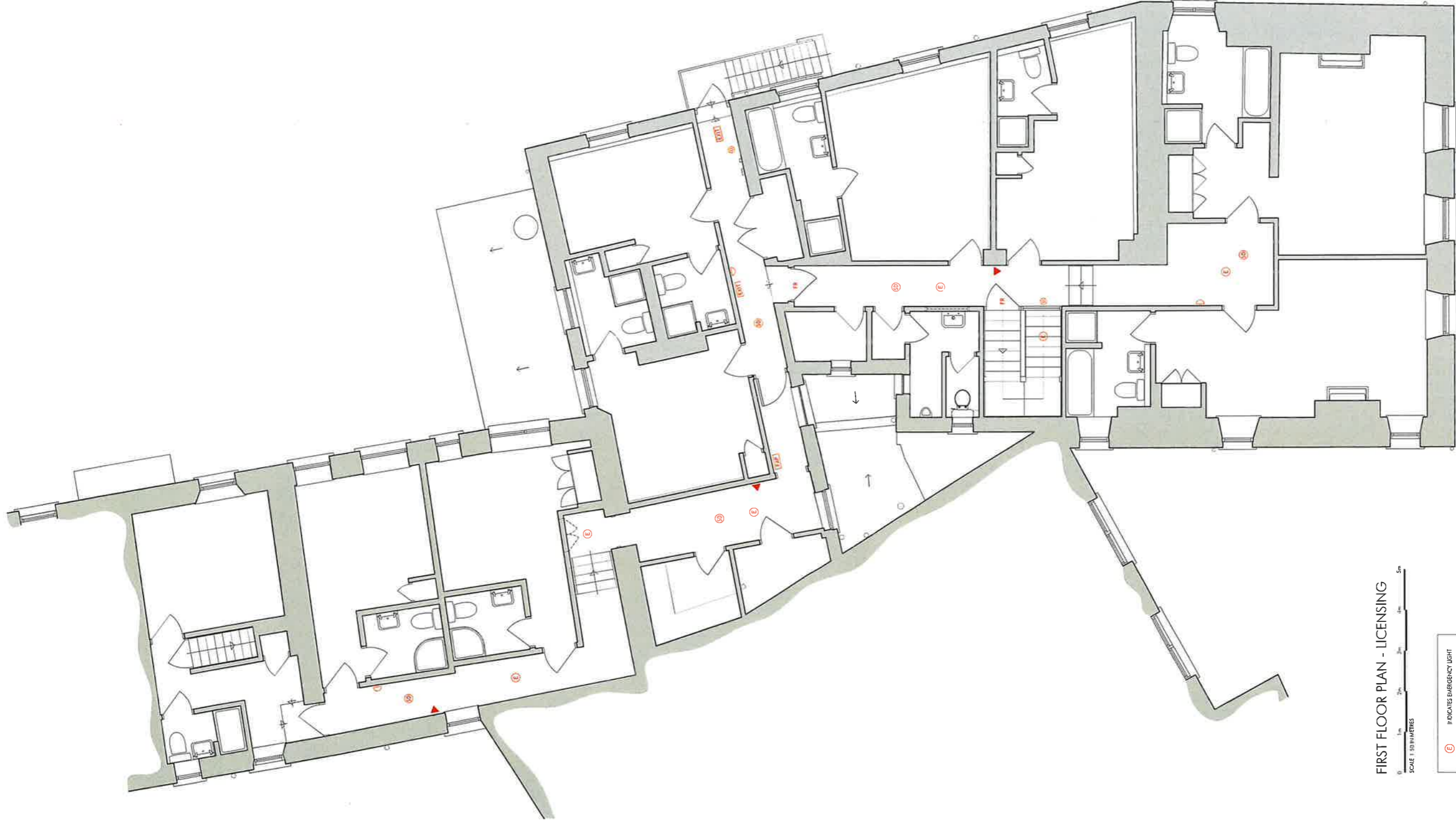
FIRST FLOOR PLAN - LICENSING