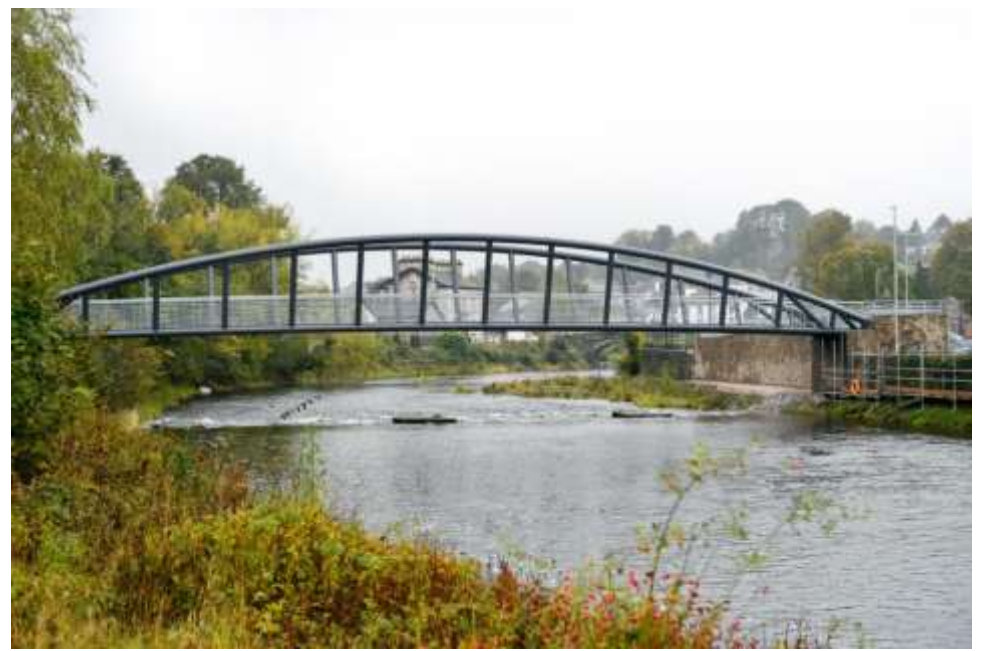
Figure 3: Gooseholme Bridge, Kendal