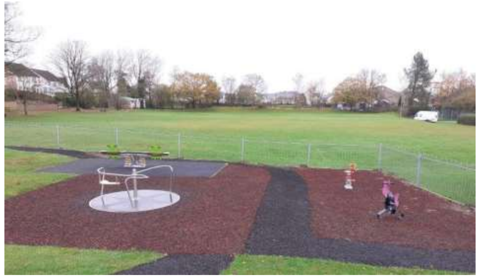
Figure 2: Improved play area, Endmoor

2.2.5 Monies from S106 obligations relating to the Sainsbury's development on Shap Road, Kendal have contributed towards improvements at the entrance to and along Stramongate. This scheme is currently in progress utilising remaining S106 monies available and other sources of funding.