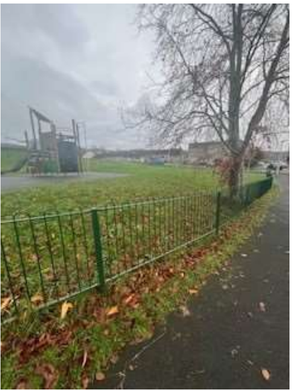
Figure 1: New fence around Hayclose Road play area, Kendal

2.2.3 S106 monies have been used to improve the Hayclose Road play area in Kendal. A new fence around the perimeter of the play area was installed in 2022.