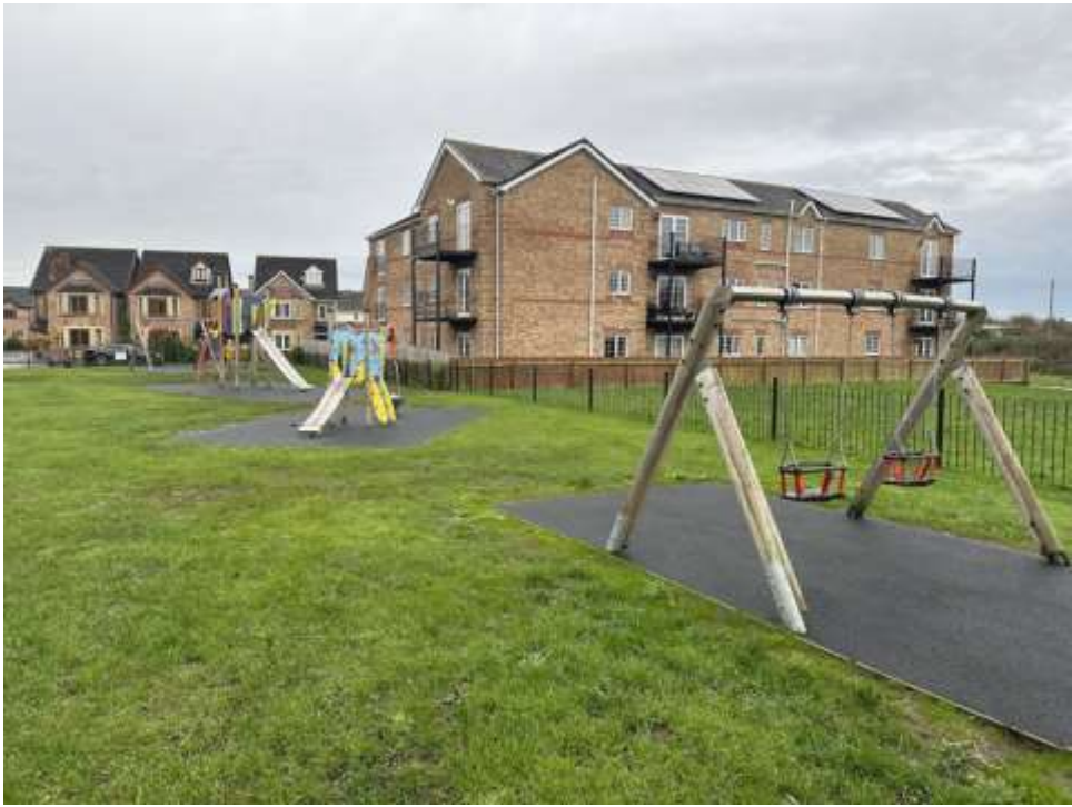
Figure 4: Children's Play Area at Sherborne Avenue, Barrow