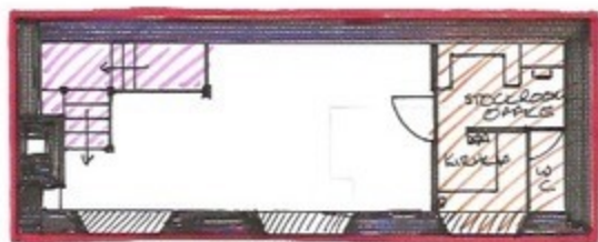
1ST FLOOR AREA 26-28 FINKLE STREET