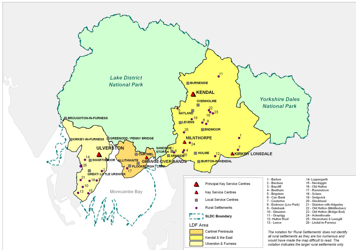
Figure 2 – South Lakeland Local Plan Area and Settlements