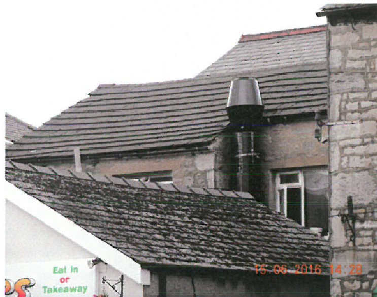
Photograph number 1, showing black flue stack.