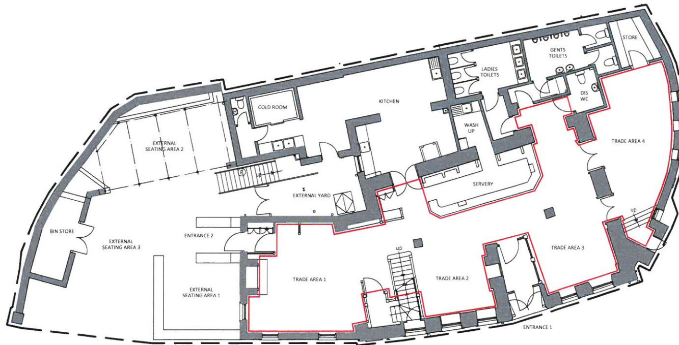
PROPOSED GROUND FLOOR PLAN SCALE: 1:100@A1 SCALE IN METRES

THIS DRAWING IS FOR LICENSING PURPOSES ONLY.