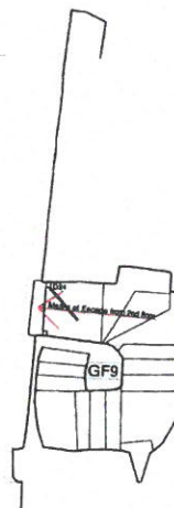
Existing First Floor Plan