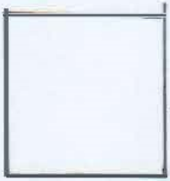
Table 33" x 33"