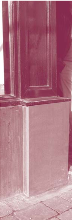
Slate stallriser in a modern shopfront in Kendal