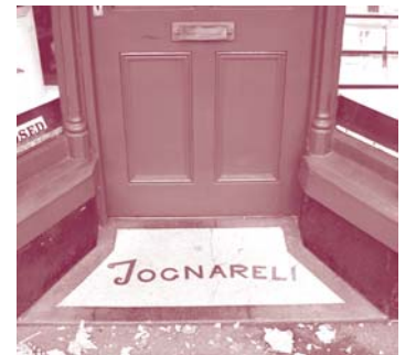
Recessed doorway in Kirkland, Kendal, which neatly incorporates the original proprietors name