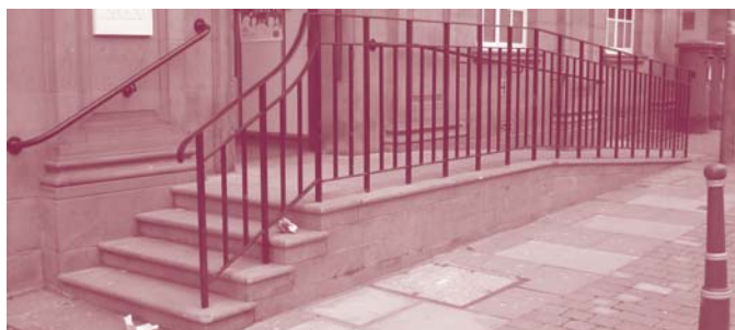
Sometimes ramps can be considered to ease access for those with mobility devices such as wheelchairs. The ramp has a shallow gradient and the handrail provides extra support and safety