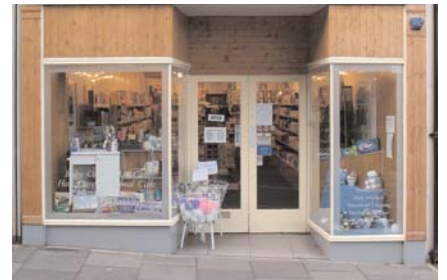
The use of unpainted timber is rarely sympathetic or harmonious in historic areas