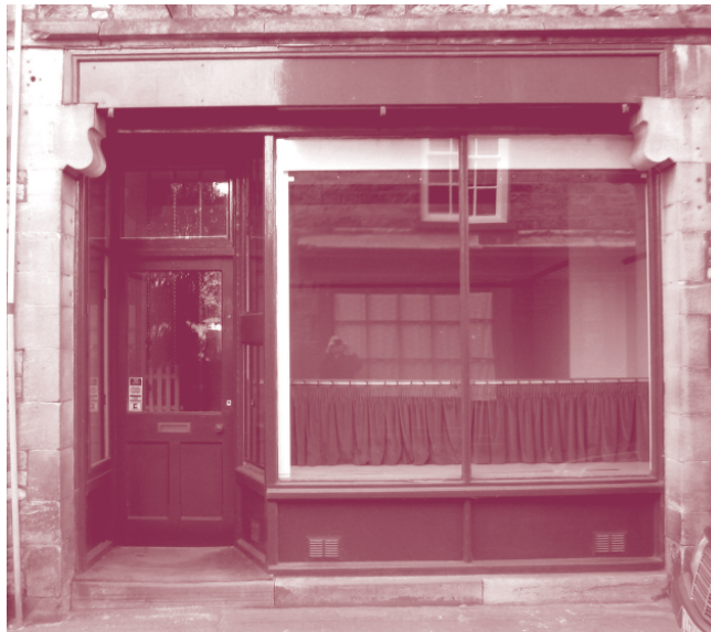
An unusual Edwardian shopfront in Kirkby Lonsdale combining carved stone pilasters and a timber lintel, which acts as fascia board