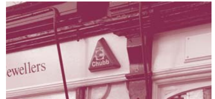
Where security alarms are fitted as a deterrent they should be chosen so as to be as unobtrusive, in terms of colour, size and location as possible