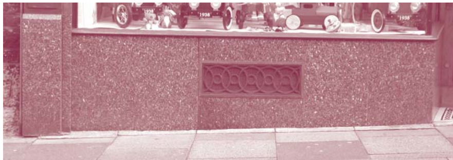
Polished granite stallriser in Grange over Sands