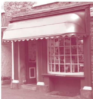
A recently added glossy Dutch blind hides the attractiveness of the shopfront behind and limits the amount of natural light entering the inside