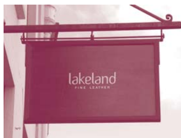
Simple hanging signs, with elegant and refined script, can be just as eye-catching as more ambitious signs, if well constructed and written