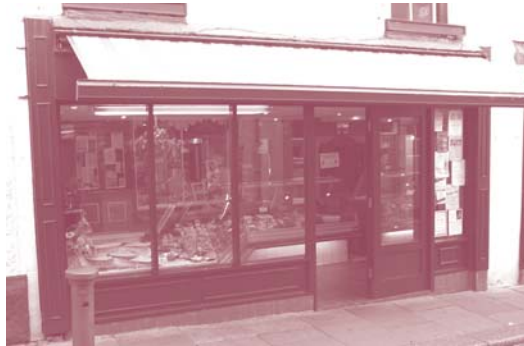
A shop in Ulverston retains its flat canvas blind, which retracts into a flush blind box above the fascia when not in use