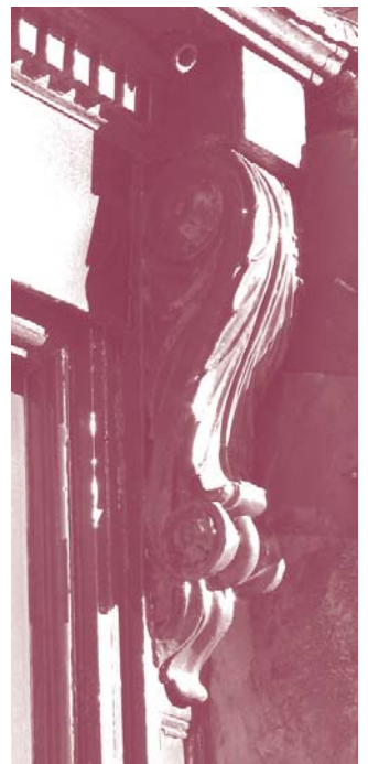
Intricately carved timber console bracket in Kendal