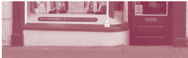
Typical rendered stallriser, protected by intricately moulded sill above, as found throughout South Lakeland