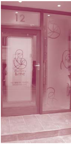
The etching on this door make the doorway evident to the visual impaired. The etched glass ensures that the door does not appear as a void.