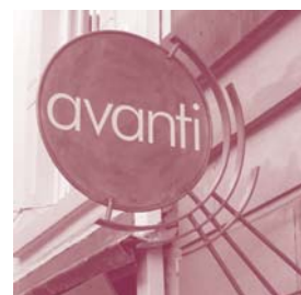
This sign is a good contemporary example of a projecting sign. It provides interest to the street scene and reflects the character and design of the shopfront.