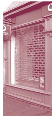
Internal security grills have the joint benefit of allowing the shop surround and any architectural details to remain unobstructed