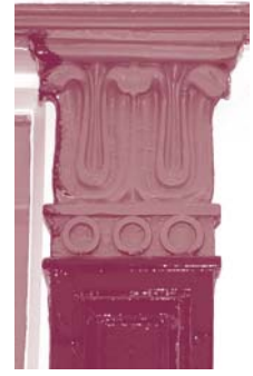
Stylised capital detail found on top of pilasters in a shop in Kirkby Lonsdale