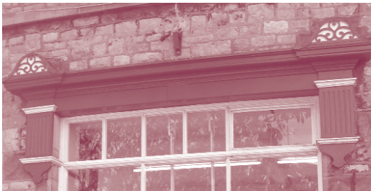
An unusual, truncated, pilaster design around an early Twentieth century shop window in Kirkby Lonsdale