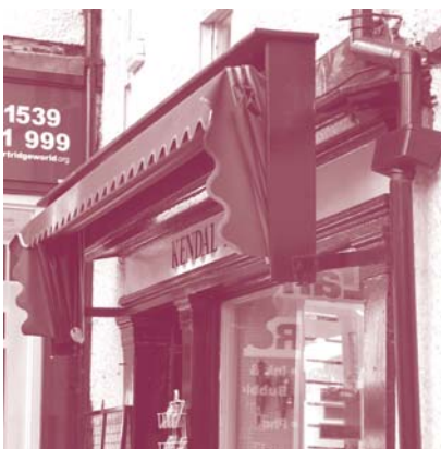
A large cumbersome housing for a Dutch blind masks the elegant shopfront behind