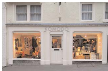
The use of relief letters, in a simple font, applied to the fascia can be very successful