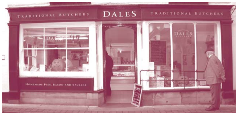
Characteristically asymmetrical arrangement for a traditional butchers shop with an opening sash window on one side that allowed the goods to be better displayed