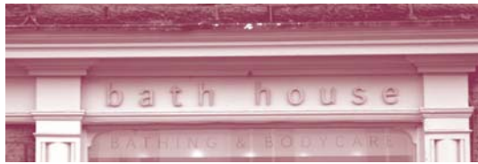
Attractively scaled, well moulded cornice and narrow fascia on traditional shopfront in Kirkby Lonsdale, with effective modern lettering added