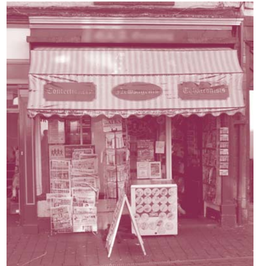
Cluttered areas outside shopfronts can act as a real obstacle to those with disabilities