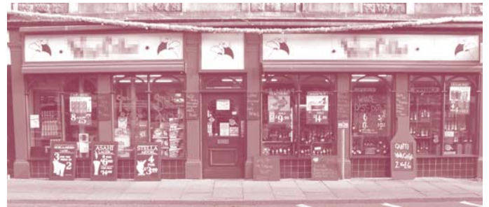
Shopfronts showing an excessive use of window stickers and sandwich boards can detract from the shopfront and limit the opportunity for easy window shopping