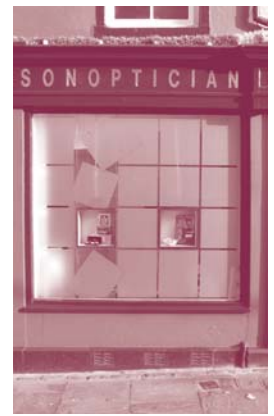
A modern shop window in Ulverston which playfully mimics a traditional pattern of glazing through the use of an etched glass design