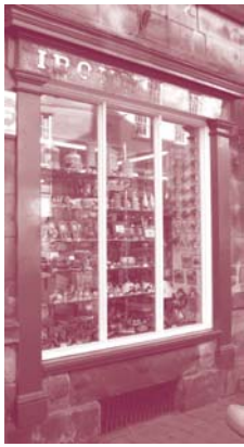
Large areas of glass can be broken up through the use of mullions, as here in a shopfront in Kirkby Lonsdale, or with horizontal transoms