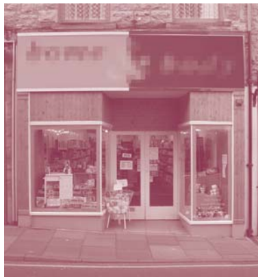
An ill thought out shopfront, with an excessively tall fascia and a lack of any cornice, help make this shopfront appear uninspiring in design terms