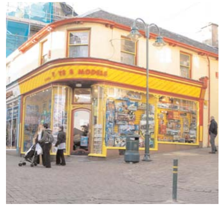
Care needs to be exercised when choosing colour schemes, as overly bright combinations can be discordant and unwelcoming