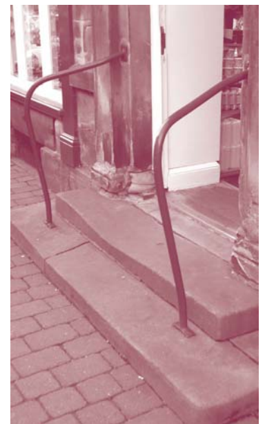
These handrails are a traditional feature, which creates interest in the street scene, as well as providing a functional service.