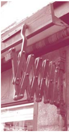
A modern variation of the flat blind with a roller mechanism positioned in the housing