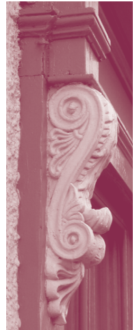
A flamboyantly carved console bracket adds richness to a nineteenth century shopfront