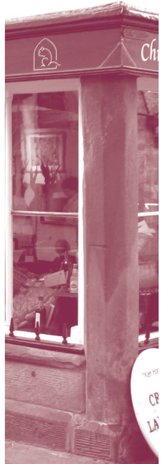
Chamfered stone pilaster in Kirkby Lonsdale