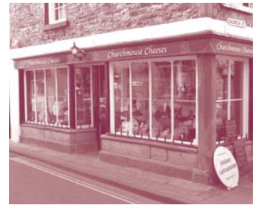
A well conceived Nineteenth century shopfront with strong vertical divisions and a recessed doorway