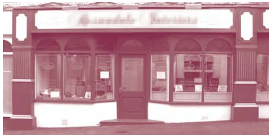
A recent shopfront with poorly proportioned pilasters, which try, unsuccessfully, to imitate those in traditional designs: here the pilasters are far too wide, have unevenly sized divisions, and fit awkwardly to the fascia and transom lights