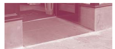
A good example of a slightly ramped door threshold which will aid access for users with limited mobility