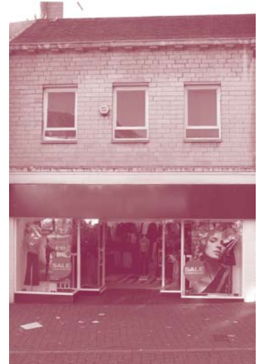
A shopfront without much by way of framing, which therefore provides little apparent support for the masonry that appears to float above