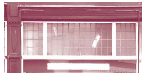
A typical transom light detail showing the use of small leaded lights