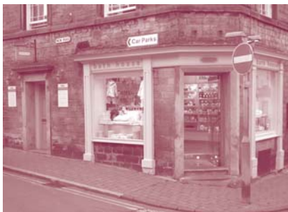
Sometimes, as a last resort, an alternative door on another wall might need to be considered to ensure access for all