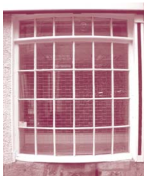
New window designs, which incorporate smaller pane sizes, have the advantage of both deterring entry and being cheaper and easier to replace if breakages do occur