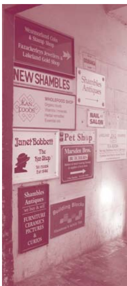
An uncoordinated clutter of signs in the entrance to a yard can conflict with each other and so reduce their overall impact

Businesses with premises in yards should give thought to producing a joint group sign for the whole yard