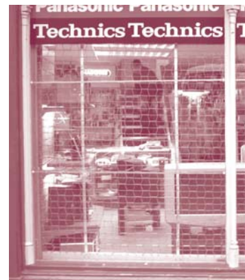
The combination of toughened glass with internal lattice grills can provide better security and still allow window-shopping to take place out of hours