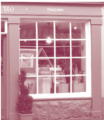
The whole window surround in this shop in Ulverston is constructed from stone