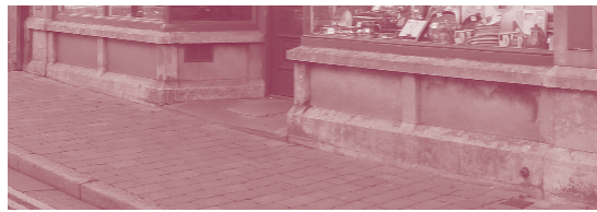
Simple panelled stallriser constructed in stone in a shop in Ulverston