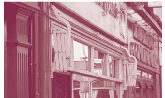
Here, a scissor mechanism folds back when a flat blind returns to its flush housing below the fascia