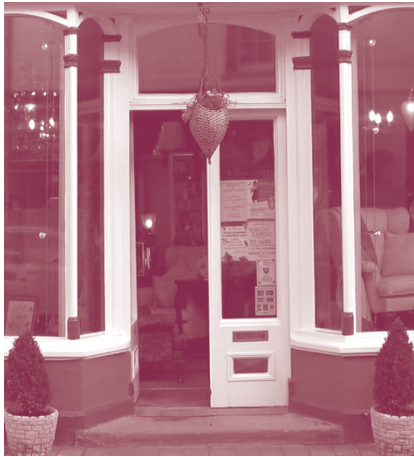
Narrow double doors and shallow steps can make access awkward for some users