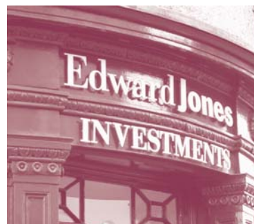
Cornice and fascia detail scaled according to classical concepts of proportion, with simple, applied relief lettering