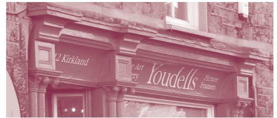
An elaborate late nineteenth shopfront in Kendal with tilted fascia and discreet modern script