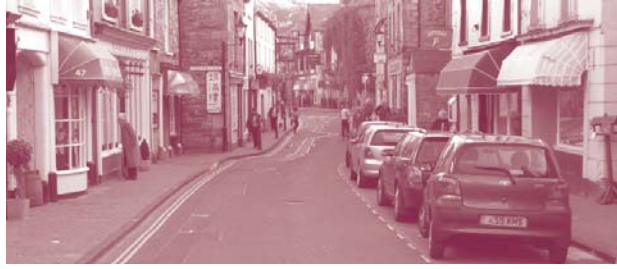
Here in Kirkby Lonsdale the historic character of the street and the individual interest of the shops is being eroded by the plethora of Dutch blinds that have been erected recently