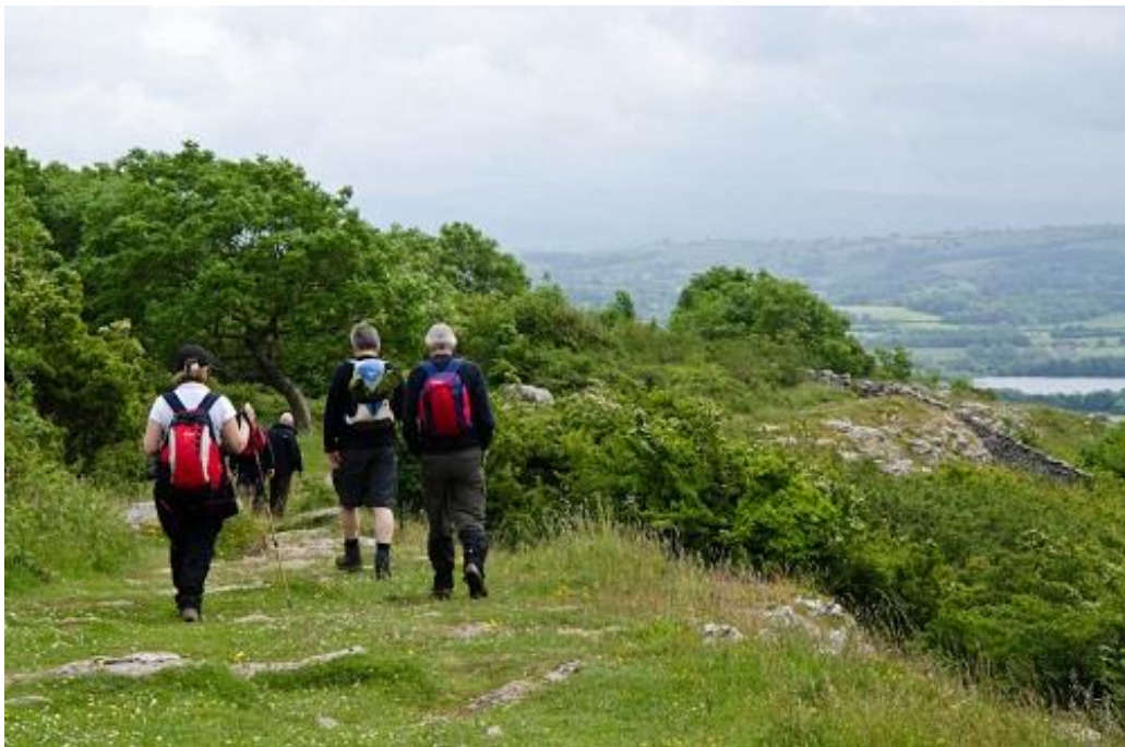
Walkers on Warton Crag

The AONB is outstanding in the extent and quality of access available, providing wonderful opportunities to enjoy quiet recreation such as walking, cycling, wildlife watching and horse riding. The network of narrow lanes and minor highways is one of the delights of the AONB and, along with an intricate web of public rights of way, access land and other paths, provides many opportunities for people to come into close contact with the area's wildlife, geology and history, providing inspiring learning opportunities and engaging visitors with the landscape.