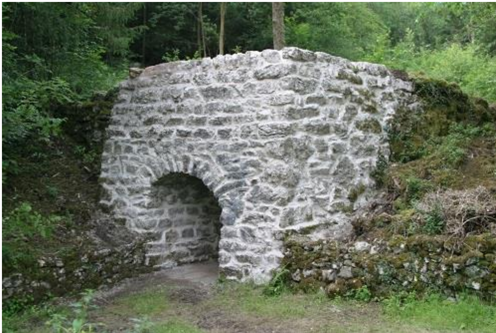
Waterslack limekiln

Local Heritage Lists are currently being developed by the local authorities within the AONB, which will identify features of local historic or architectural interest and which also make a positive contribution to the unique historic character of the area.