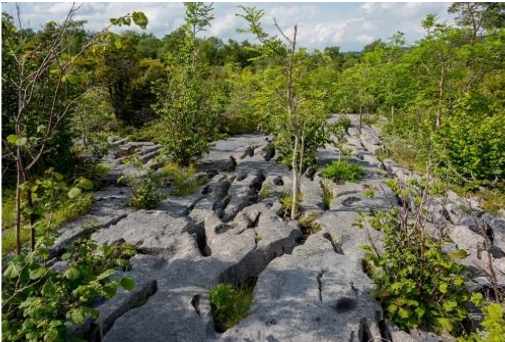
Limestone pavement at Gait Barrows

The distinctive Carboniferous limestone geology underpins the landscape of the AONB, unifying its character and creating the conditions that have allowed the wide diversity of habitats to develop. The limestone landscape of the AONB is particularly unusual and therefore nationally important because it was both formed at low altitude and shows significant evidence of glacial and post-glacial processes. A distinctive 'karst' landscape has formed through the dissolution of the soluble limestone rock.