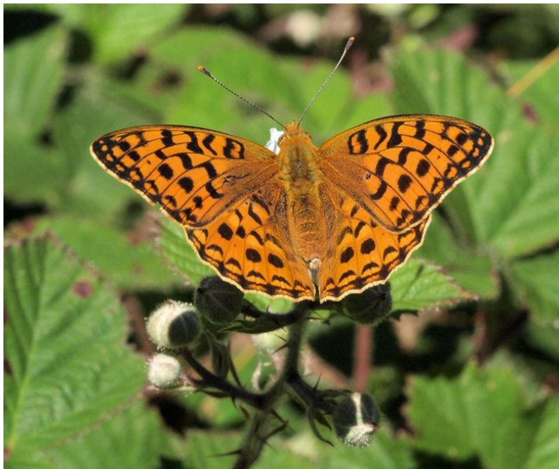
High Brown Fritillary

The numbers and diversity of butterflies are particularly impressive with 34 species occurring here. Well over half the UK's flowering plant species have been recorded along with many notable breeding birds and internationally significant numbers of waders on high tide roosts and feeding on long distance migrations along the coast each autumn.