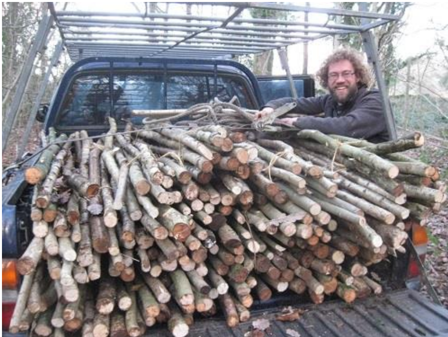
Coppice worker

Vibrant communities exist within each of the villages and there is also a shared identity with parishes coming together as part of the AONB, strongly connected to the landscape. Working the land is the foundation of the rural economy; the long-standing cultures of low-intensity pasture management and woodland coppice management have created much of the distinctive landscape character we see today and the area remains very much a living working landscape.