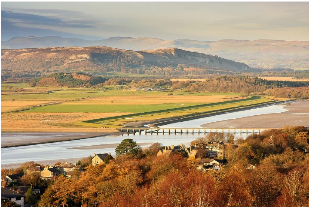
View north from Arnside Knott

The small-scale yet complex nature of the landforms gives an intimate feeling within the valleys and woodlands which contrasts with the open nature and expansive views from higher ground and along the coast.