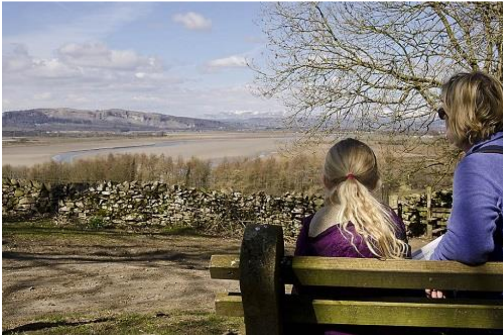
Enjoying the view

The AONB is a place for inspiration, spiritual refreshment, dark skies at night and clear, unpolluted air. People come here to relax, unwind and recharge their batteries, to get close to nature, breathe in the fresh sea air and absorb exhilarating wide open views. Tranquillity and a sense of space are easy to find both in the intimate inland landscape and on the hills and open coast.