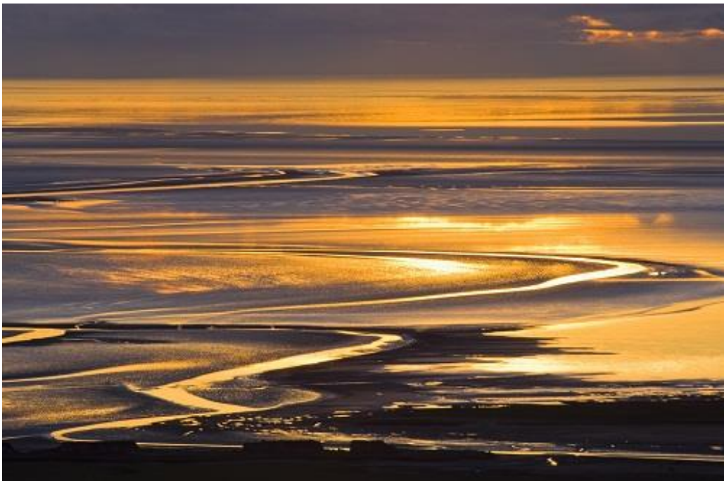
Sunset over Morecambe Bay

On the east and north of the Bay, the intertidal flats are bordered by extensive areas of salt marsh, only covered by the highest tides.