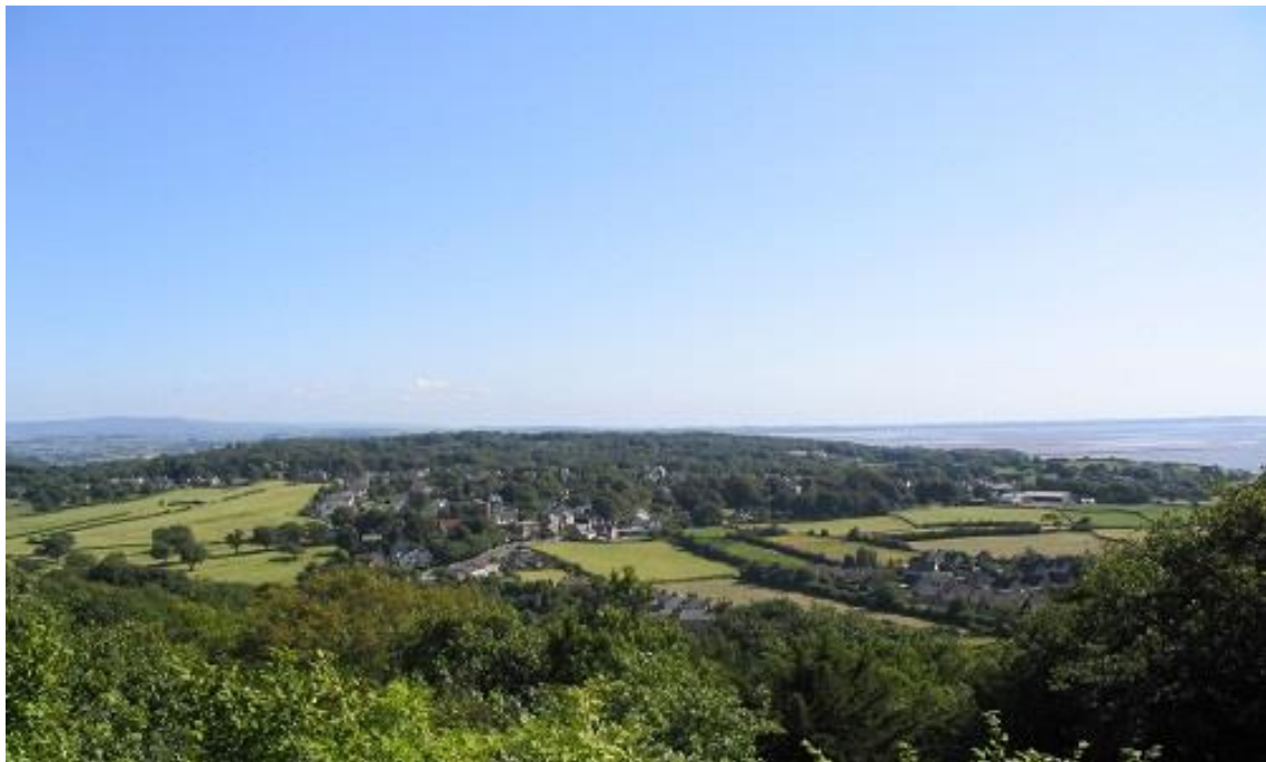
View of Silverdale

While there is evidence of occupation within the AONB dating back some 12,000 years, it is the stone buildings and settlements created during the last 800 years which contribute so strongly to the character and quality of the landscape today. This contribution lies not only in the strong vernacular traditions of the area but also in the settings of many of the buildings and the character of individual villages and hamlets.