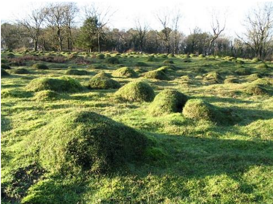
Unimproved limestone grassland with anthills

An outstanding number and mix of priority habitats create a mosaic which is home to an amazing diversity of wildlife. The variety and importance of the wildlife in relation to the small size of the area is a unique quality of this AONB. Historically, the limestone geology was gradually overlain by acid, neutral and alkali soils of varying character. This unusual and varied range of soil conditions together with the area's geographical position, varying climatic influences and different kinds of human management has enabled the different habitat types to develop.